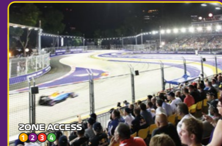
Patrons at the above-mentioned grandstand have access to Zones 3 and 4 where ticketholders can enjoy performances at the Padang Stage, Downtown, Esplanade Outdoor Theatre and Uptown.

Patrons will also be able to savour a vast array of food and beverage offerings, participate in activity stations and entertainment at the grandstand's undercroft and at Uptown.